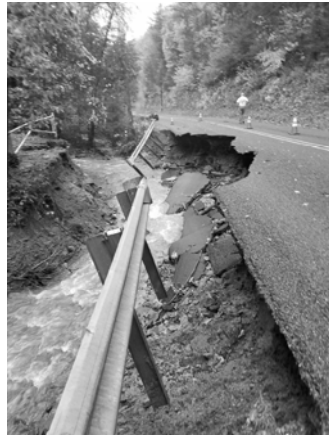
Purdue Mt. Road

The unprecedented rain storm that occurred on October 20-21 created significant damage in Benner Township. While we wish we could say that this storm is becoming a distant memory, it is still very fresh in many of our Purdue Mountain residents' minds as well as Township personnel and will continue to be for sometime. The Township was at least fortunate that this event was declared a Federal disaster allowing for Federal and State funding to assist in repairs. We are now faced with the process of following the applicable federal procurement standards that apply to this type of funding. These standards and policies require a much different and longer process than we are accustomed to. The Township is proceeding with repairs as fast as possible, however, the federal/state process has a number of internal steps that do not allow for any sort of "fast track" construction and if not done correctly could result in non-reimbursement of expenses. FEMA's damage estimates for the Township total over 1.2 million dollars.