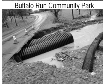
Buffalo Run Community Park