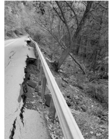
Purdue Mt. Road